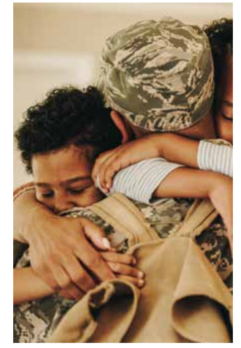
online in seconds. To learn more about a COE and eligibility requirements for VA home loan programs, visit <u>www.va.gov/homeloans</u>.

A COE can be obtained VA.gov, by mail, and directly by lenders. Most COE's are issued